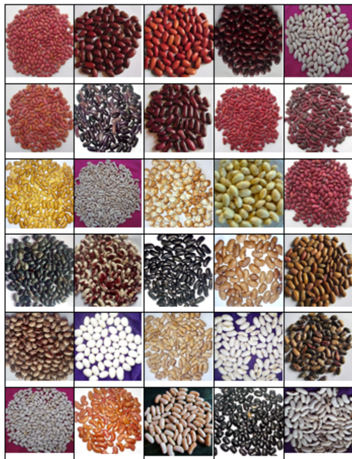
Figure 1. Representative diversity of seed shape, colour and shape.

The material comprised of 203 lines of common bean belonging to diverse growth habits, maturity and market classes (comprising local landraces as well as accessions procured from national and international gene banks) including 3 checks namely Shalimar Rajmash-1, Shalimar French Bean-1 and Arka Anoop. Shalimar Rajmash-1 and Shalimar French Bean-1 are varieties released by SKUAST-Kashmir and Arka Anoop is a variety released by IIHR, Bangalore. The material was collected from diverse areas of J&K state and represented a diverse market classes defined by seed colour, shape and coat pattern (Figure 1).